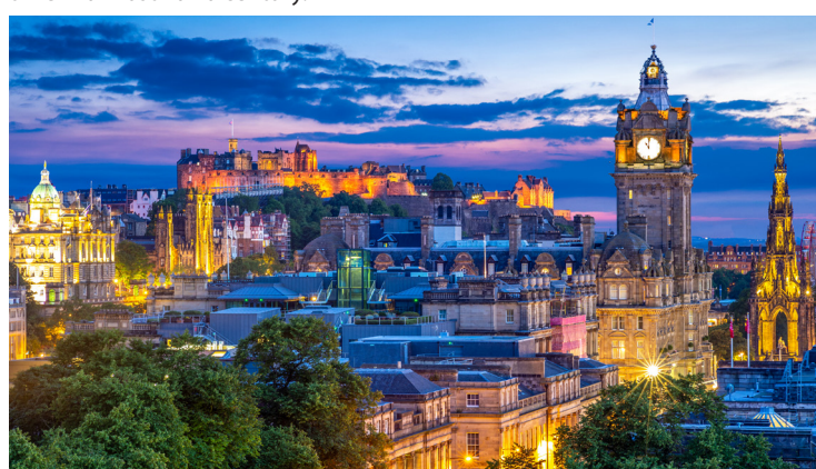
DAY 18 Wednesday 3 September, 2025

Today we visit Edinburgh, the royal and ancient capital of Scotland. On our sightseeing tour we see the ancient Royal Mile with its cobbled streets which forms the backbone of the Medieval Old Town and leads from the Palace of Holyrood all the way to Edinburgh Castle. Later we will travel on the Borders Railway, the longest new domestic railway to be built in the UK for over 100 years. The 30 miles of track sees passenger trains running from Edinburgh, through Midlothian and into the Scottish Borders to Tweed Bank for the first time in almost half a century.