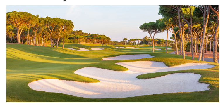
DAY 6 Friday 3 October, 2025

Today we will take a leisurely drive south to the beautiful Algarve region, characterised by soaring cliffs, sea caves, golden beaches and scalloped bays. Our home for four nights is the Conrad Hotel.