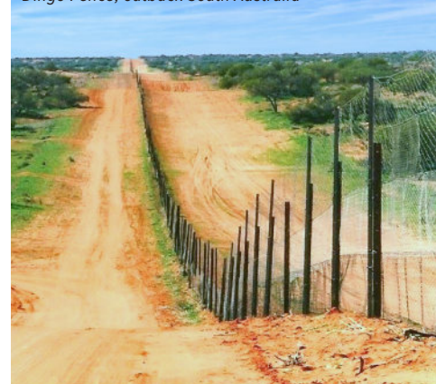
Dingo Fence, outback South Australia

Morning: Visit Burke's Grave and the beautiful Cullyamurra Waterhole, both a few kilometres east of our hotel. The scenery along Cooper Creek, in the vicinity of Innamincka, is stunning. Beautiful water holes, fabulous gum trees, and lots of colourful Australian birds. Then visit the famous Dig Tree, where on May 22, 1861, Burke, Wills and King probably realised they were doomed. Afternoon: You will have some free time. You may like to visit the former Australian Inland Mission Hospital building, now a National Parks office and museum, located right next to our hotel. Late Afternoon: Further exploration of Cooper Creek. Travel to the west of our hotel, including a visit to King's Marker (marks the spot where King was found alive by a search party following the Burke and Wills expedition). Evening: Enjoy a fun-filled Aussie Campfire Singalong, in the beer garden of our hotel. We will invite the locals to join us. (B)