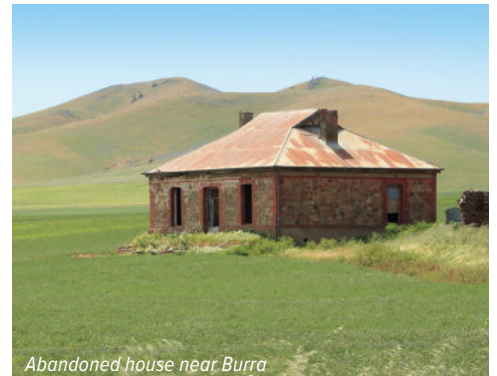
Abandoned house near Burra

This morning we travel south, heading for the Barossa Valley. Along the way we visit historic Burra, once a booming copper mining town. After a tour of the town you may like to sample one of the delicious local Cornish pasties, for lunch. Continue on to the Barossa Valley, one of Australia's premium wine growing regions. After a panoramic tour of the district we will visit a well-known winery. Then check into our accommodation, in Nuriootpa, one of the Barossa's main towns. Evening: Enjoy a performance by excellent local 'German' band, Über Oompah. The Barossa Valley, with its German heritage,