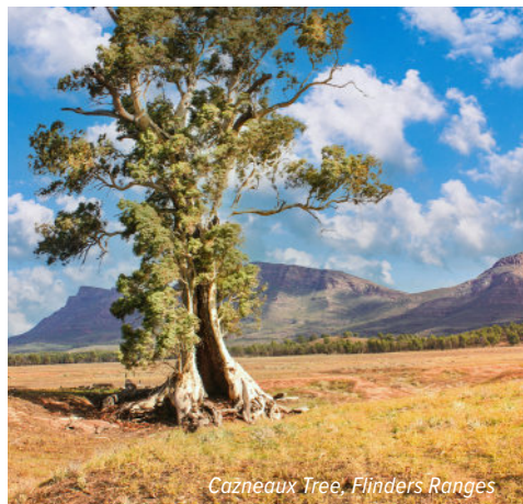
Cazneau Tree, Flinders Ranges