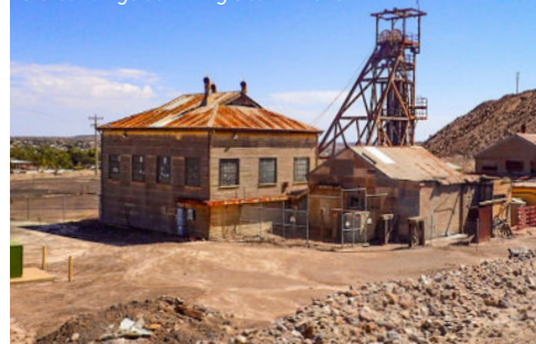
Old buildings at mining site in Broken Hill