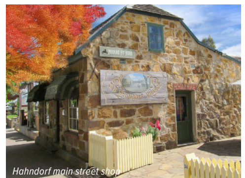
Hahndorf main street shop

Return to Melbourne, arriving approximately 6.45pm and the tour concludes. (B)