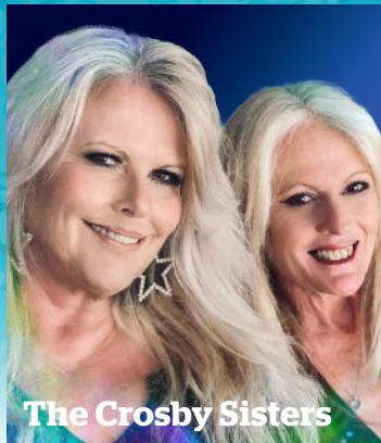
The Crosby Sisters