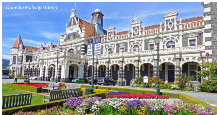
Dunedin Railway Station