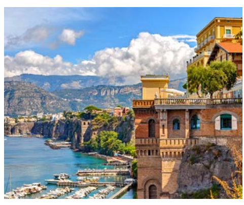
DAY 17 Sunday 23 August 2026 Salerno

Today we visit Salerno on the Amalfi Coast. Travel to the beautiful resort town of Sorrento with its spectacular views of the Bay of Naples and Mount Vesuvius. Or you may like to take a tour and visit the ancient, perfectly preserved ruins of Pompeii, a wealthy settlement of the Roman Empire, destroyed by the eruption of Vesuvius in 79AD.