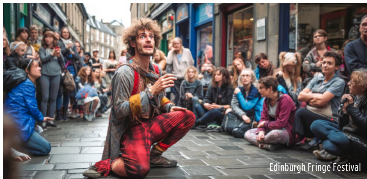
Edinburgh Fringe Festival

Today we travel, by coach, to Edinburgh, Scotland. On the way visit England's beautiful Lakes District, including the charming villages of Windermere and Bowness. Afternoon: Arrive in Edinburgh – one of Europe's most beautiful & historic cities. While we are there, the city will be hosting the spectacular Royal Edinburgh Military Tattoo, and the colourful Fringe Festival. Evening: Explore the colourful Fringe Festival activity, in the streets of Edinburgh. You may like to attend a Fringe Festival concert (optional). Overnight: Accommodation to TBC (to be confirmed). (B)