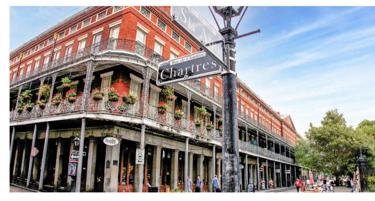
DAY 18 Thursday, 10 April 2025